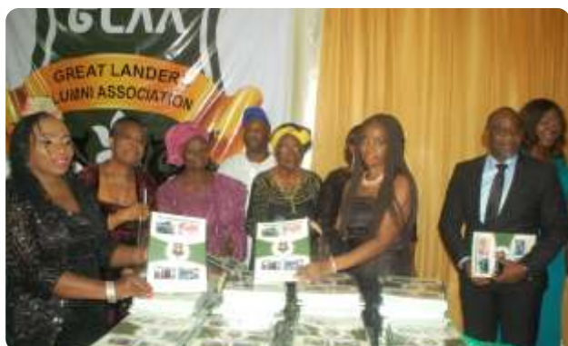
Lauching of the Alumni Magazine