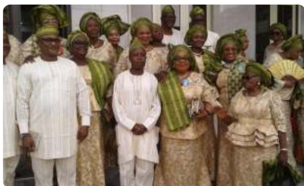
@The 50th Anniversary Thanksgiving Service