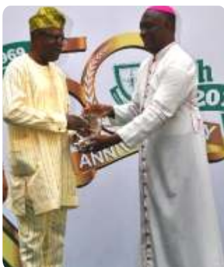
Award for Great Landers From the School