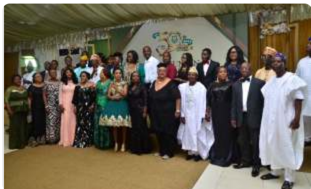
Exco & some members of the Alumni