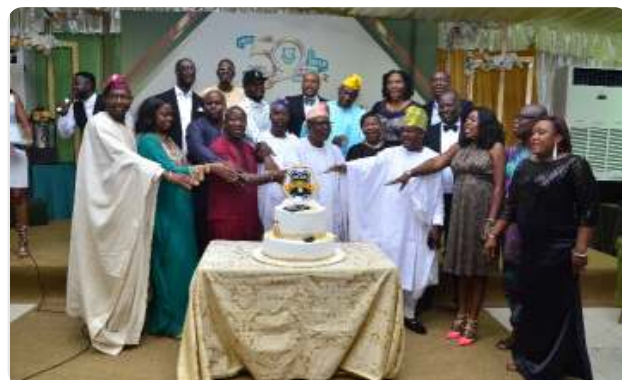
Set Presidents cutting the Anniversary cake