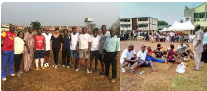
Novelty Match during the 50th Anniversary Celebration