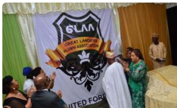
Unveiling of the Alumni Logo