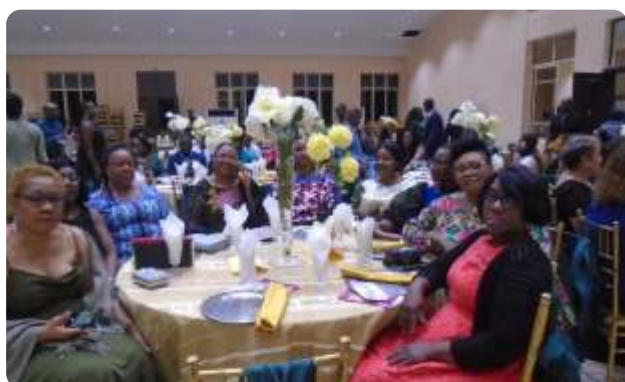
Great Landers @ the School's 50 th Anniversary dinner