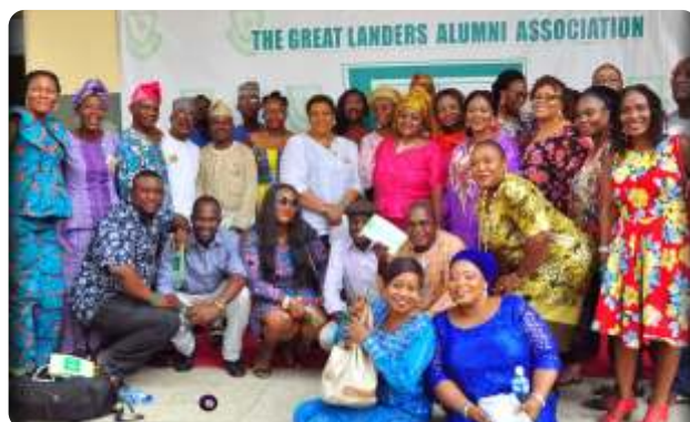
Landers @ 49th Anniversary of MCSS