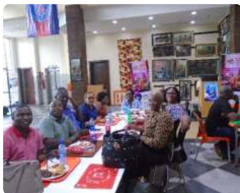
Goodby Lunch after the Reunion & 50 th Anniversary celebrations