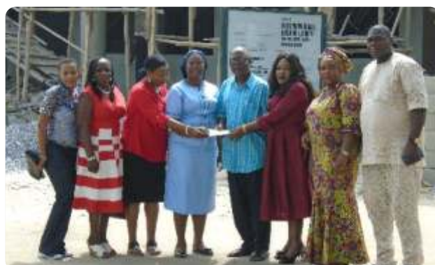
Presentation of Great Landers 50 th Anniversary Gift to the School.