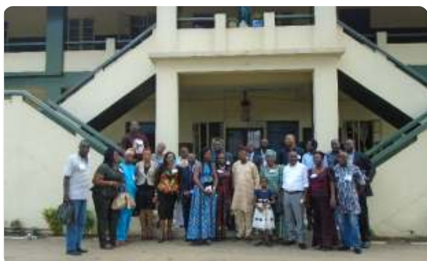
26th October 2017 meeting of Landers